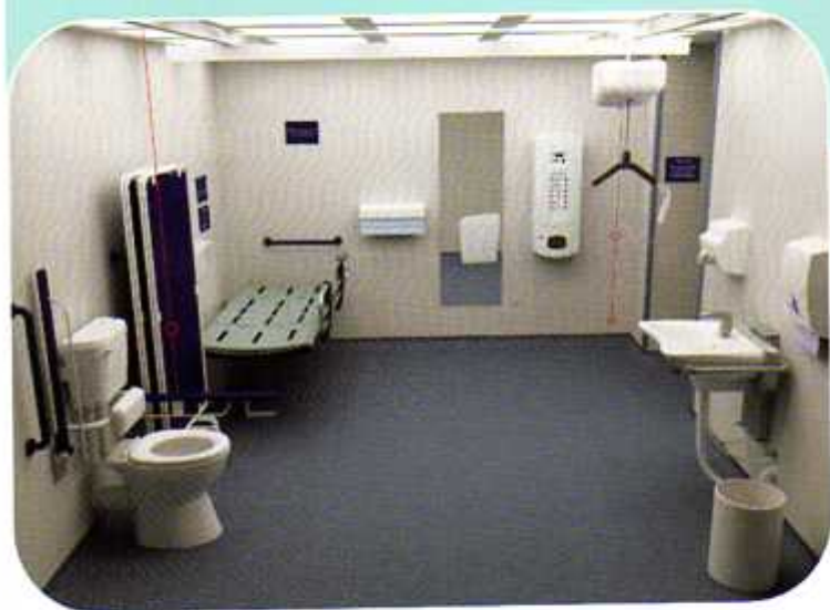
One example of a Changing Places toilet

Imagine having to change your son, daughter or partner on the floor of a public toilet. Most of us would agree that this just isn't acceptable. But it is the reality for many family carers, who simply have no other choice.